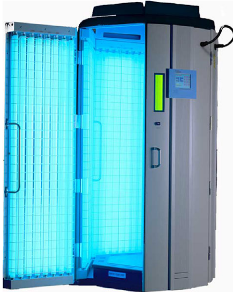
Figure 2 Phototherapy booth

Inconvenience and cost can be curtailed with the use of a home light unit (ibid). Home NB-UVB phototherapy can be as effective as office-based phototherapy, while increasing patient satisfaction with treatment (ibid). Potential side effects and their incidences do not differ significantly between home UVB phototherapy and outpatient pho-