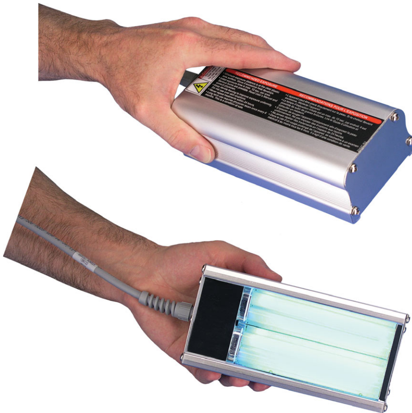
Figure 3 Hand-held phototherapy device

The practice of phototherapy dates back to ancient history. In the past century, there have been great advances in delivering targeted therapy in specific wavelengths that have dramatically changed the management of many cutaneous inflammatory dermatoses. Despite the introduction of potent biological agents for the treatment of difficult-to-manage diseases, the cost-effectiveness, ease, and the relatively safe side-effect profile of phototherapy makes it a