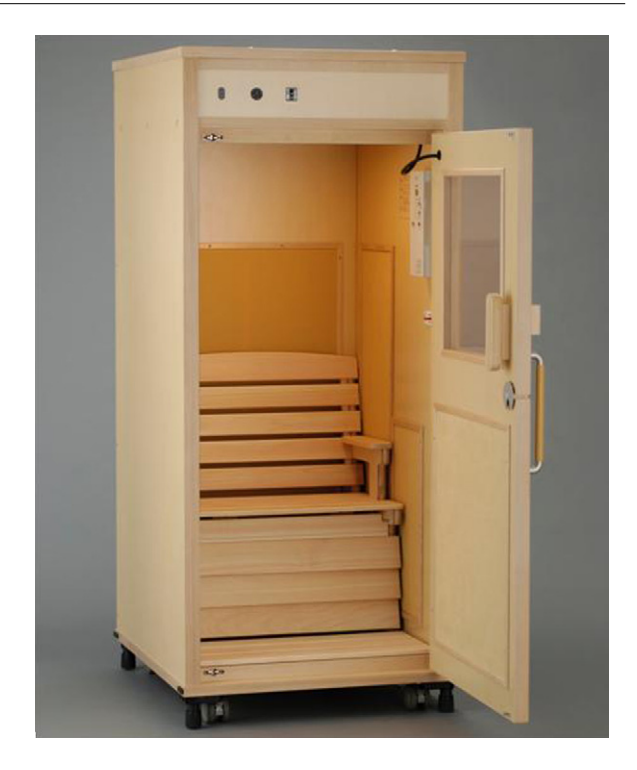
Figure 1 Movable and sitting-position sauna system. The temperature at the top and bottom of the chamber is uniformly maintained at the same temperature of 60 °C.

Waon therapy uses a far infrared-ray dry sauna, which is evenly maintained at 60 °C and differs from traditional sauna. Waon therapy has an absence of hydration pressure, and was performed as previously reported [10]. Briefly, the patients were